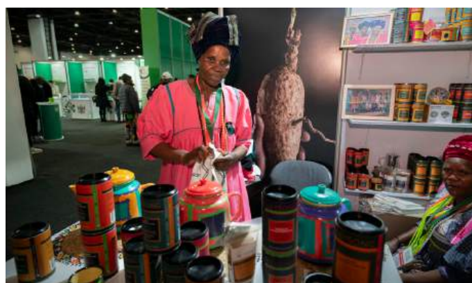
Thirty small businesses were supported to attend the African Biotrade Festival to display their ingredients and products and meet new potential customers and consumers

Held in Johannesburg from 14 to 16 September 2023, in partnership with the 2nd Organic & Natural Products Expo Africa (O&N), the festival attracted more than 4,000 visitors including 550 dedicated registrations for the ABF.