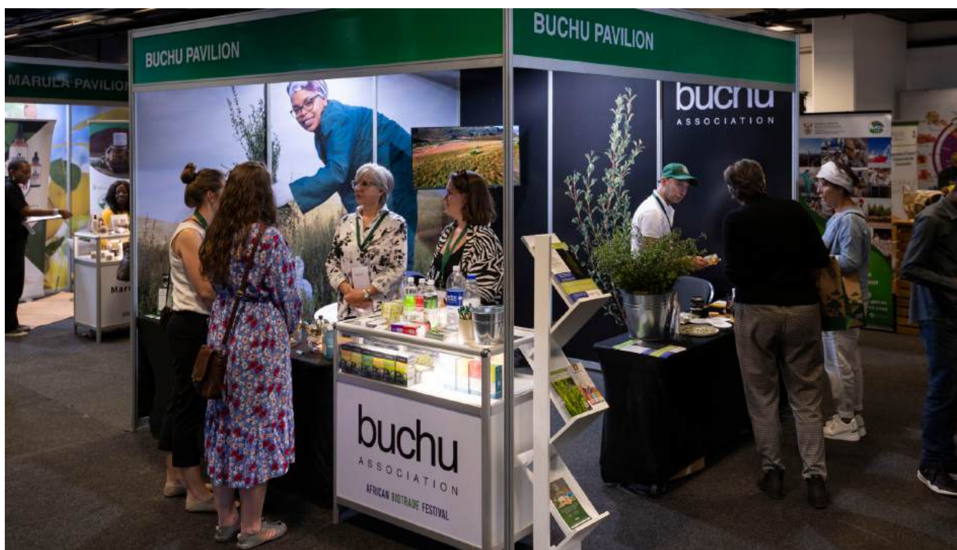
The Buchu sector pavilion was popular with African Biotrade Festival visitors interested in learning about a high-value indigenous plant species

The ABF featured six pavilions dedicated to high-potential biotrade species and their sector organisations, and one specialist pavilion to showcase biotrade research, testing and standards. The species on show included Baobab, Marula, Buchu, Sceletium, Honeybush and various indigenous species used for essential and vegetable oils.