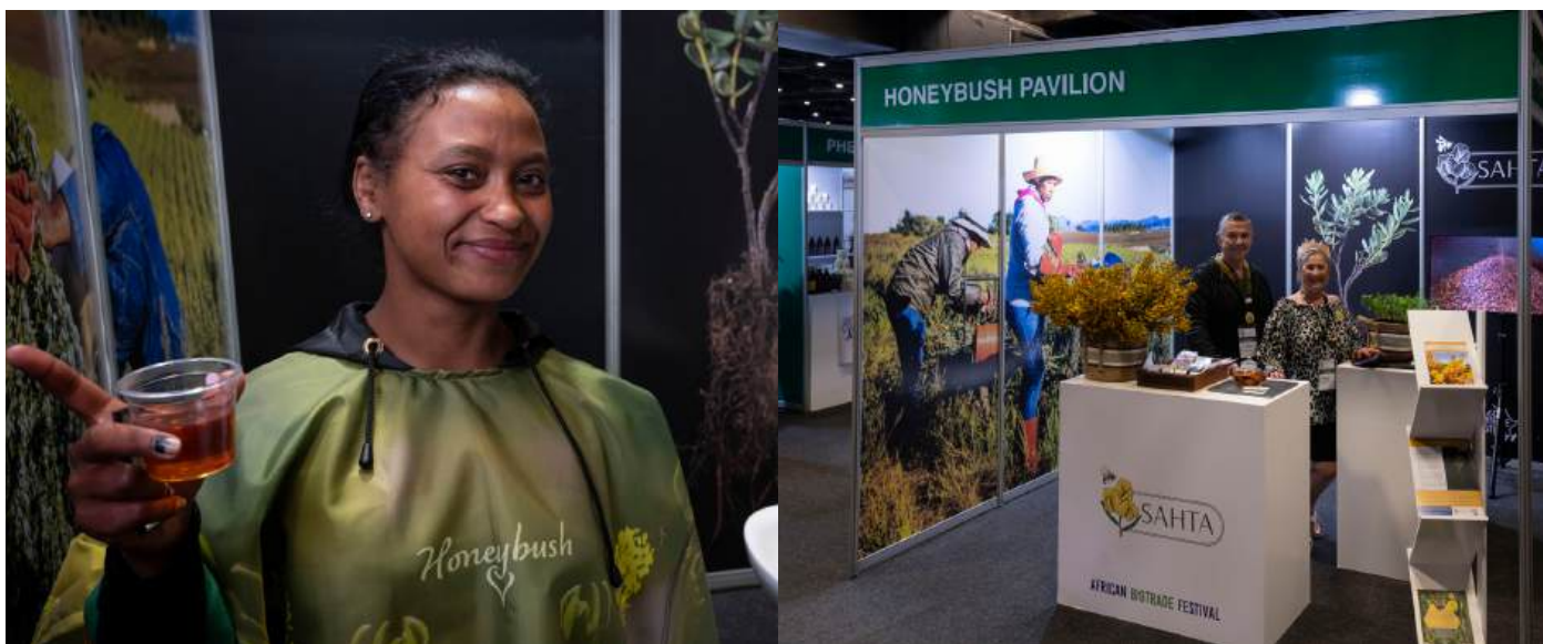
The Honeybush community was well represented at the festival, with a dedicated pavilion and a number of small business stands

Also at the festival was a popular tasting experience featuring indigenous Honeybush and Rooibos teas. Biotrade producers and manufacturers have traditionally had to travel at great expense to international trade shows to showcase their products; but the African Biotrade Festival has now established itself as a powerful domestic event which contributes to an economically sustainable and equitable biotrade sector.