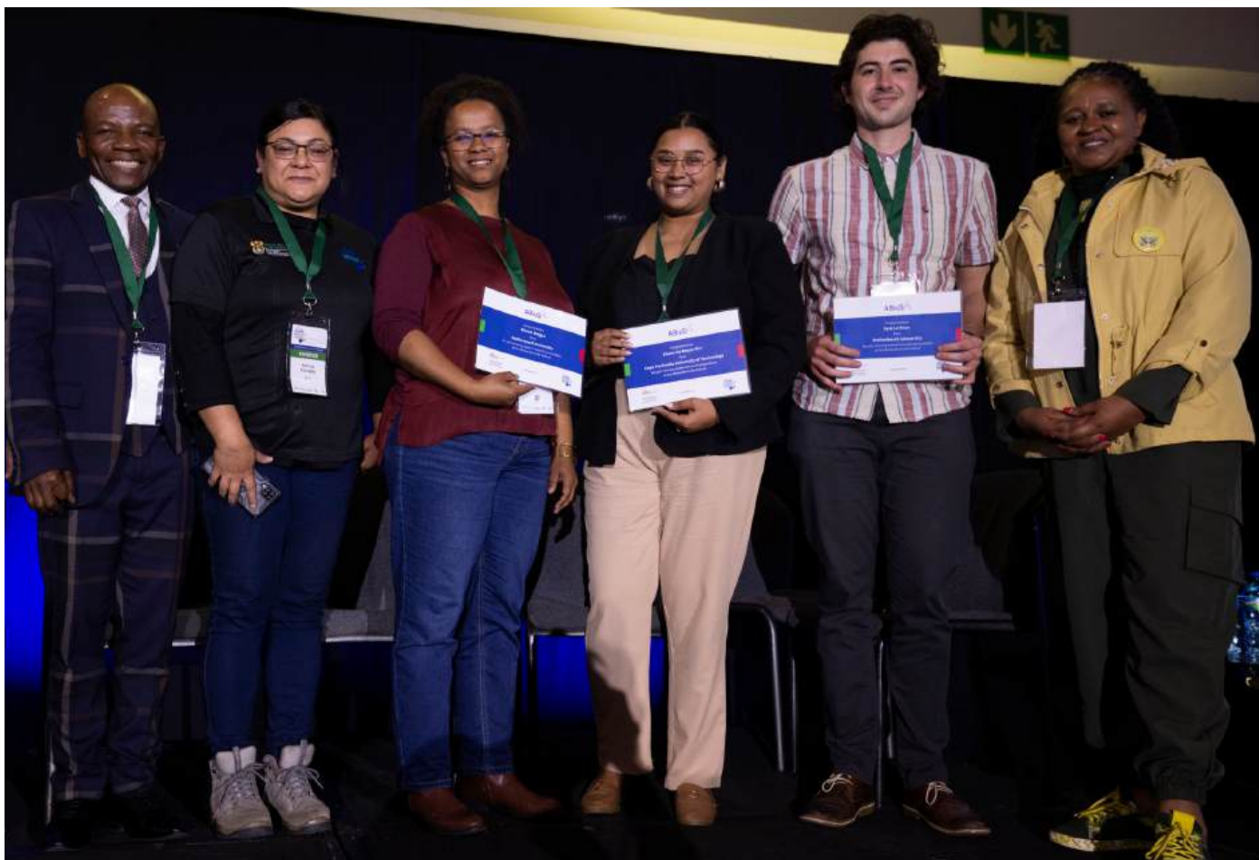
Six students made excellent presentations about relevant and high-impact research, with three selected to attend an international conference of their choice

Six students were given the opportunity to present their research, which included health and medical benefits of biotrade species, modelling of efficient oil extraction, environmental sustainability and community cultivation methods.