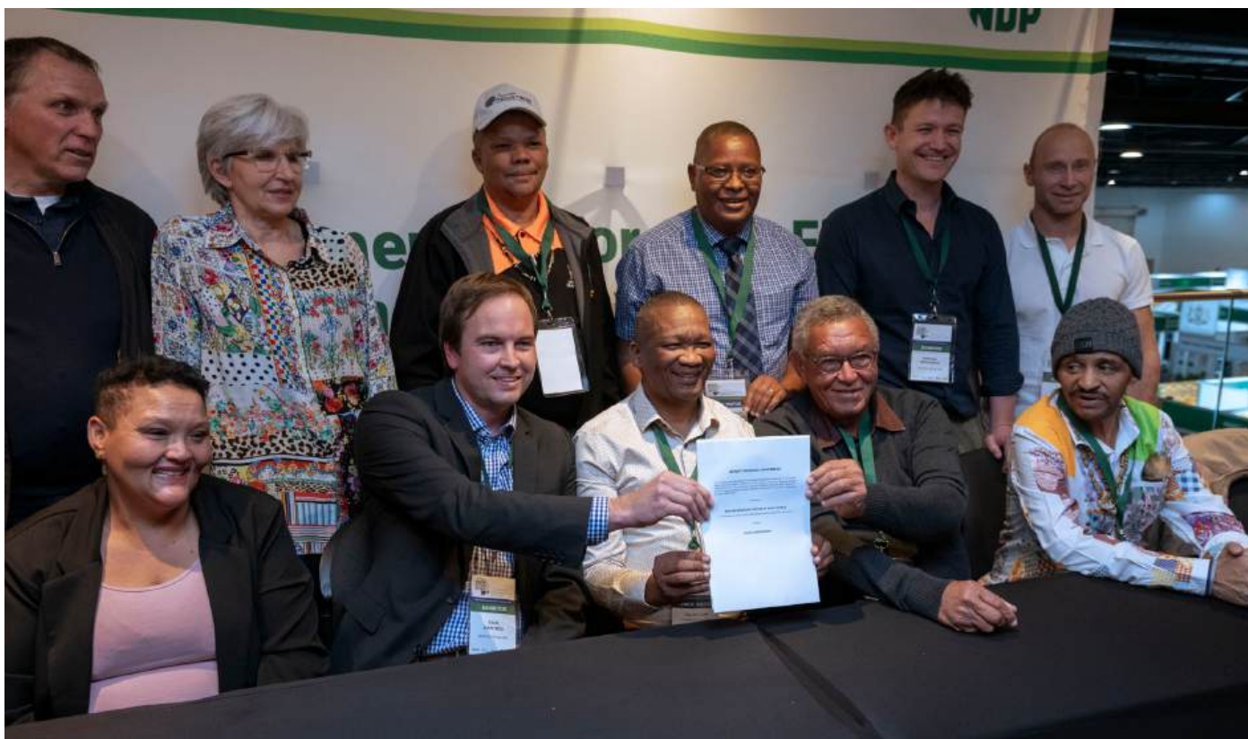
A landmark agreement was signed between the SA government, Buchu Association, the National Khoi Council and South African San Council

Among many highlights at the event was the historic signing of an Access and Benefit-Sharing (ABS) agreement between the Buchu Association, the SA government represented by DFFE, the National Khoi Council and the South African San Council.